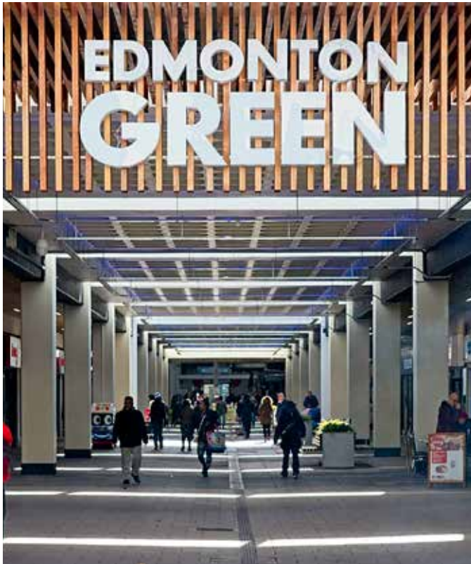
Current image of Edmonton Green shopping centre.