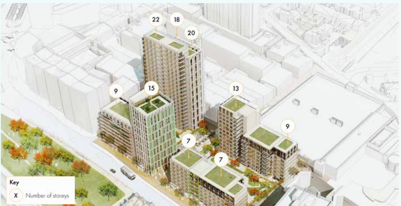
Sketch image of proposed Phase 1 development with building heights.

At first floor level two podium gardens create landscaped amenity space for the residents. This will feature seating areas, planting and play space.