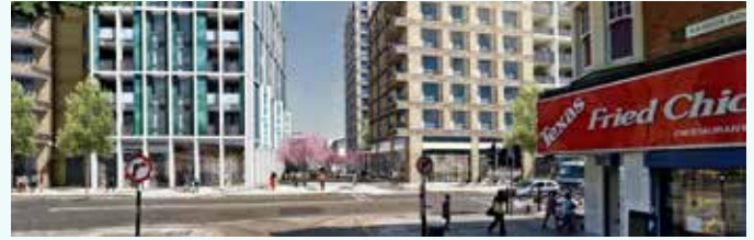
Proposed view along Fore Street.