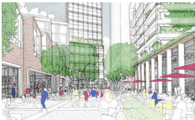
Sketch view of the proposed Library Square.