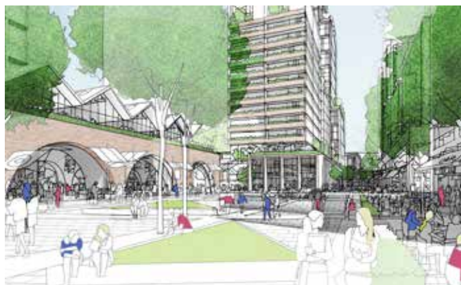
Sketch view of the proposed Market Square.