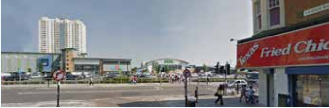
Existing view along Fore Street.

The first phase will involve the redevelopment of the south car park site between ASDA and Fore Street. We propose to build four new buildings on this site with shops at ground floor level and homes above. This will form an important east-west route through to the town centre and the future gateway to the new market square.