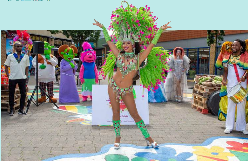
A Month of Sundays event