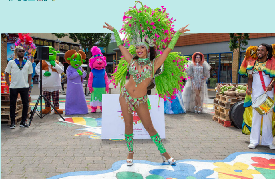
A Month of Sundays event